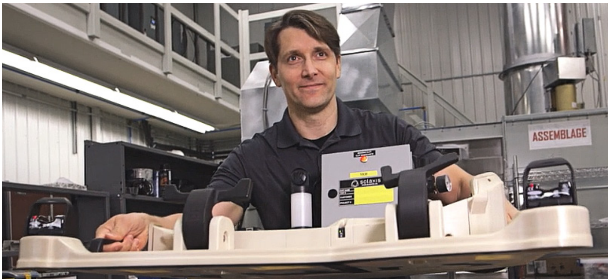
3D printing this automotive door seal jig resulted in an 80% weight reduction and a decrease in task cycle time.

This is one area that shouldn't be ignored. The U.S. Occupational Safety and Health Administration estimates injuries cost employers close to $1 billion per week in direct worker compensation. 1 Repetitive strain injuries build over time and progressively impact your workers, reducing their effectiveness and productivity until they need to be relieved. Lighter, more ergonomic 3D printed tools can help reduce or eliminate lost time injuries due to this type of repetitive strain, minimizing the impact on production and benefitting your workers.