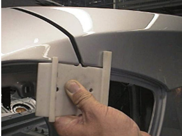
A worker inspects the fit on this auto assembly using a 3D printed check gauge.