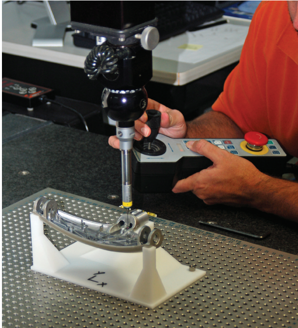
This CMM inspection fixture was created in a fraction of the time it would take to manufacture metal tooling.

An example where AM inspection tooling can be “doubled up” is with CMM fixtures and surrogate parts. First-article inspections on new products usually require setup of inspection fixtures to determine that the parts meet specs. But until the first article is produced, validation of the inspection program has to wait, adding delays. Instead of waiting, an accurate first article can be 3D printed and used to verify the CMM programming. It’s just one example of how you can leverage additive manufacturing in multiple ways to save time and expedite production.