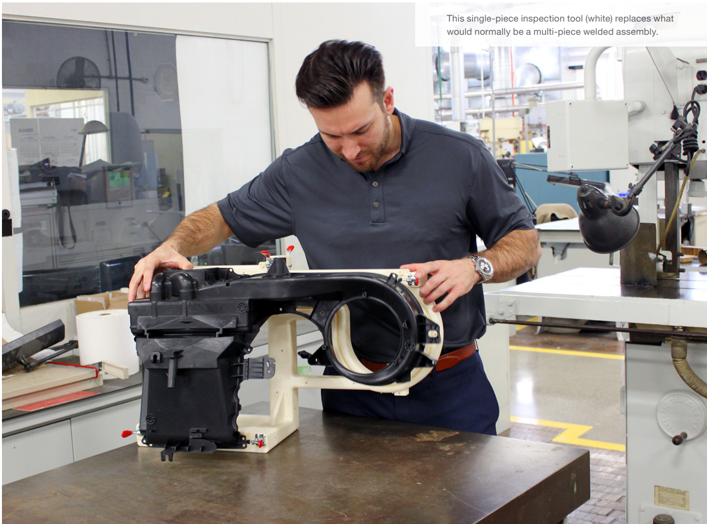
This single-piece inspection tool (white) replaces what would normally be a multi-piece welded assembly.

The combination of these benefits – lower cost, faster creation, better design – makes it possible to create and deploy more tools in the production process. Faster production cuts the time needed to tool up a new production line. Tools that could make tasks more efficient and precise but couldn't previously be justified due to time and/or cost, now can be. New tools that make tasks easier to accomplish increase task efficiency. More fit-check tools on the assembly line ensure any quality escapes are noticed and addressed earlier. The result is a compounding effect of reduced cost and increased efficiency throughout the production process.