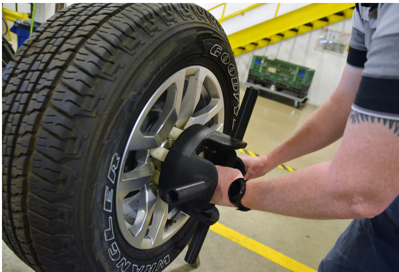
This 3D printed assembly tool provides a lighter, faster means of installing wheel lug nuts.

3D printing lets you iterate your tool design much more efficiently. Print the tool, try it and if changes are needed, revise the CAD design and print another one. This allows you to optimize and achieve the best tool design. In most cases, this wouldn't be possible with machined tools due to the time and cost involved.