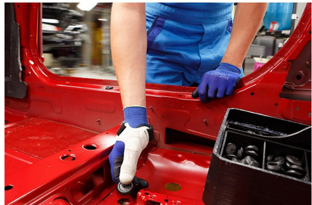
The white 3D printed thumb tool provides leverage to reduce fatigue and prevent overuse injury when inserting these plastic plugs.