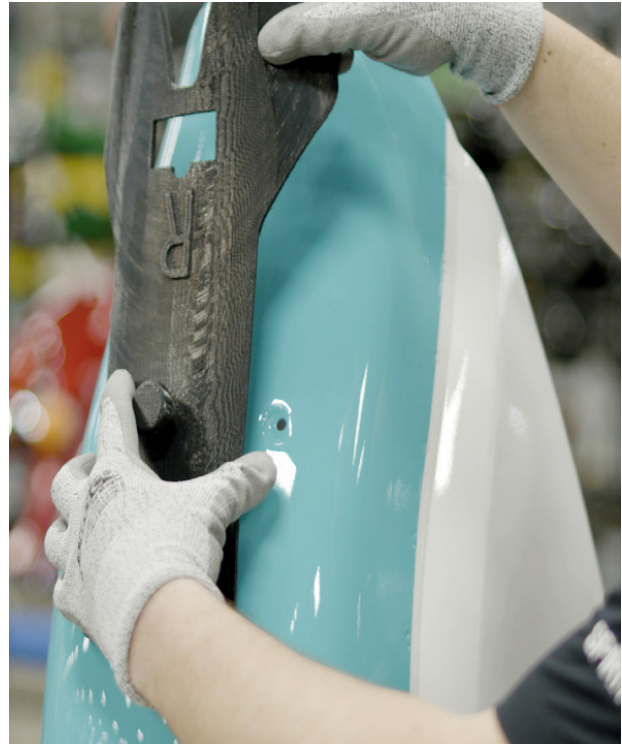
A soft-touch, flexible assembly tool made from TPU 92A elastomer locates a badge on the motorcycle tank without marring the painted surface.

There will always be some applications that demand the use of metal. But many, arguably most, jigs, fixtures and assembly aids can be 3D printed with FDM thermoplastics.