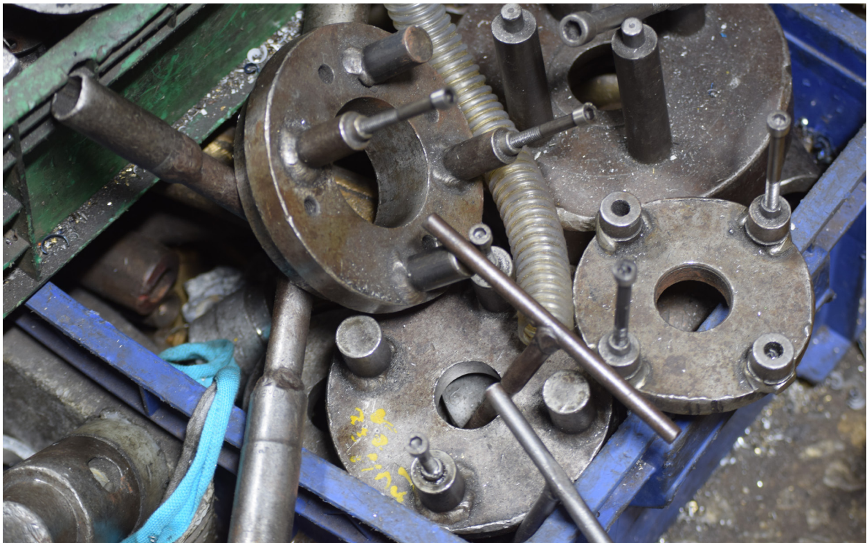
3D printed tools can replace typical metal, multi-part, welded assembly jigs like this.

This tooling paradigm has been and continues to be the norm for most manufacturing operations. But it extracts a penalty in the form of limiting a manufacturer's capabilities to improve operations. That might sound counterintuitive because tools help facilitate production. But not when they're too expensive, hard to justify and too limited to change the current situation. Most operations simply make do and assume the status quo is a cost of doing business.