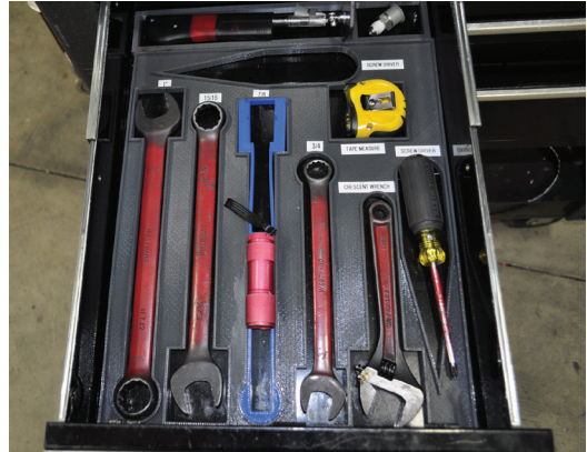
The design freedom of additive manufacturing makes it easy to create custom tool holders and sorting trays.

FDM technology also offers a fast and inexpensive way to create thermoforming tools that can be used to create multiple bins, conformal trays and packaging material. This avoids the time and cost you'd typically incur with a machined metal thermoform tool.