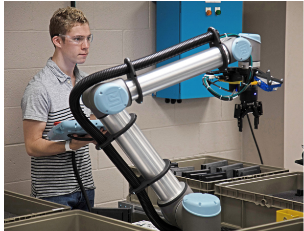
Lighter 3D printed end-of-arm tools reduce the load on robotic arms and are typically faster and less costly to make than their metal counterparts.