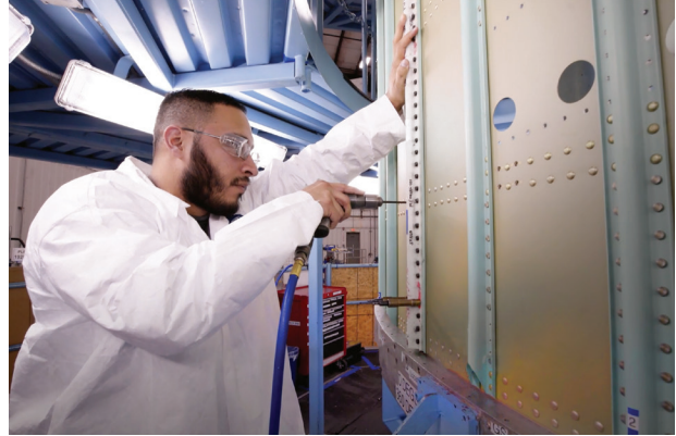
Easily fabricated drill fixtures speed the assembly process on this space launch vehicle.

Robotic end-of-arm tools (EOATs) are a good example where AM's lightweight strength and design freedom make conventional units obsolete. A lighter EOAT makes it possible to use smaller robot actuator motors or increase the arm's actuation velocity. 3D printed EOATs can also consolidate multi-part designs and incorporate internal vacuum channels and other integral features.